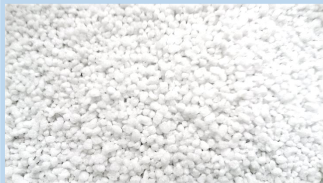
CONSTRUCTION PERLITE (1) GRANULE SIZE: 0,77 - 3,2 mm Bulk Density: 34,91 kg/m 3 (Milled Perlite: 0,6 - 1,2 mm)