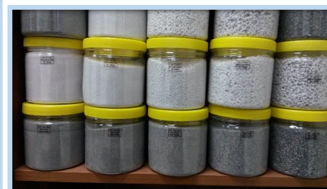
MILLED AND EXPANDED PERLITE SAMPLES