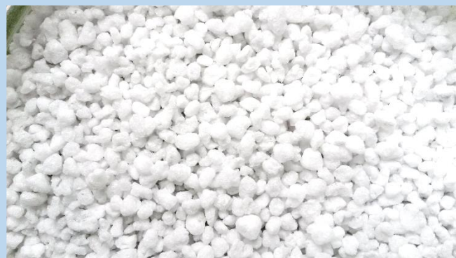
AGRICULTURAL PERLITE GRANULE SIZE: 2 - 5 mm Bulk Density: 81,25 kg/m 3 (Milled Perlite: 1,2 - 2,4 mm)