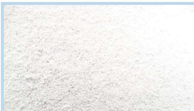
FILTER PERLITE GRANULE SIZE: 0,077 - 1,020 mm Bulk Density: 53,3 kg/m 3 (Milled Perlite: 0,077 - 0,3 mm)